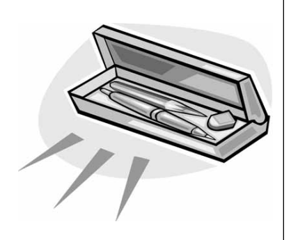
Sets containing both exempt and taxable items

Articles that are normally sold as a unit must continue to be sold in that manner; they cannot be separately priced and sold as individual items in order to obtain the sales tax exemption.