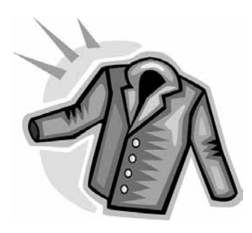
List of taxable and tax-exempt items

Tax-exempt items purchased by mail order (including transactions over the Internet) will qualify for the exemption if the order is accepted by the mail-order company during the exemption period for immediate shipment. When the acceptance of the order by the mail-order company occurs during the exemption period, the exemption will apply, even if delivery is made after the exemption period.